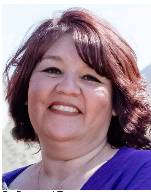
By Deswood Tome